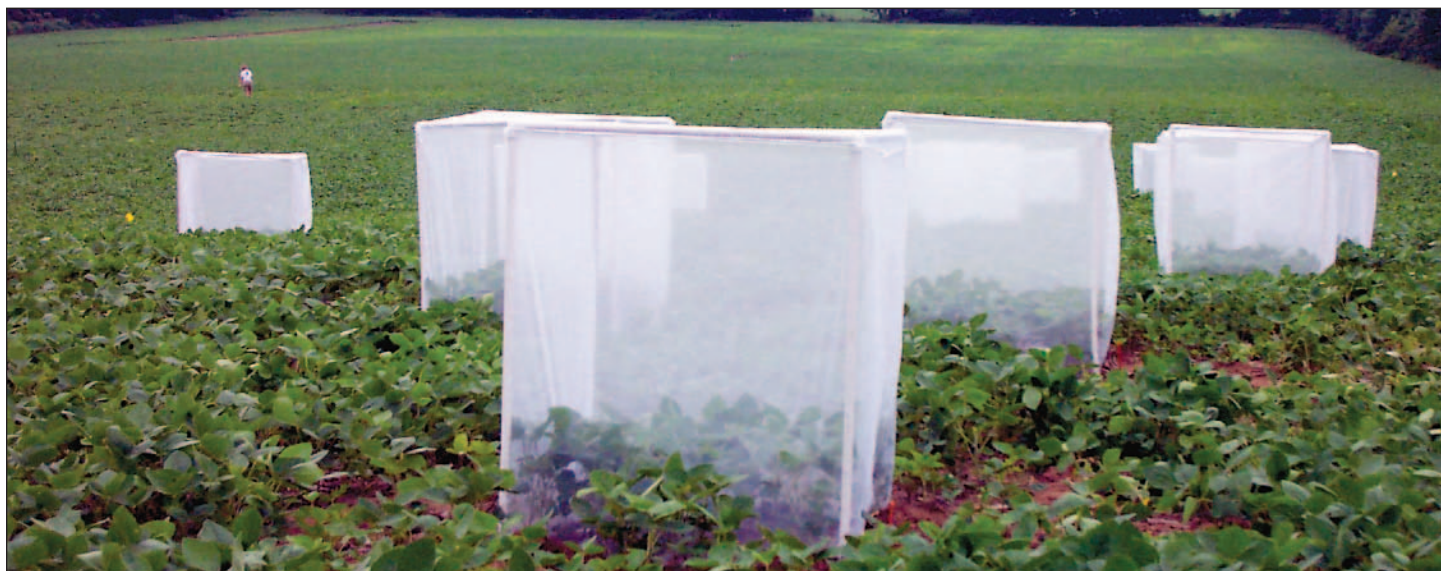
Predator-proof cages used to measure population growth rate of aphids on K-deficient and K-amended soybean, southwest Michigan, July 2003.