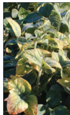
Soybean leaves showing symptoms of K deficiency.

application of potash fertilizer at a rate of 140 lb of K 2 O/A. Clip cages and exclusion cages were used to monitor reproductive performance of aphids. A clip cage was a small predator-proof enclosure clipped to a leaf to measure the growth and reproduction of individual aphids. Exclusion cages were 6 x 6 ft., covering 10 plants each, and prevented predation on the introduced aphids, but allowed escape of any aphids which morphed into alate (flying) form.