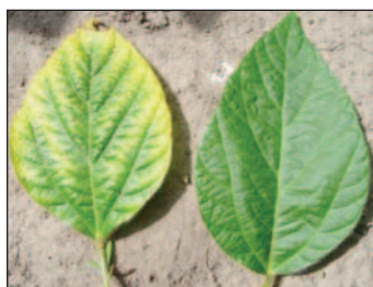
Potassium deficient (left); healthy leaf.