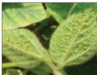
Aphid infestation on a soybean leaf.

with soil K and P and leaf K, N, P, and S. However, peak aphid densities were positively correlated with the same suite of soil and leaf nutrients.