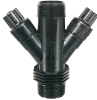
1 1/2" Pressure Regulator (11 - 35 GPM flow range)

Fixed pressure regulators are commonly used with 8 mil driplines. They are pre-set at 12 or 15 psi, are non-adjustable and are recommended for use with manually operated systems.