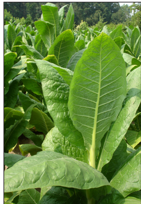
Healthy, large Tobacco leaves