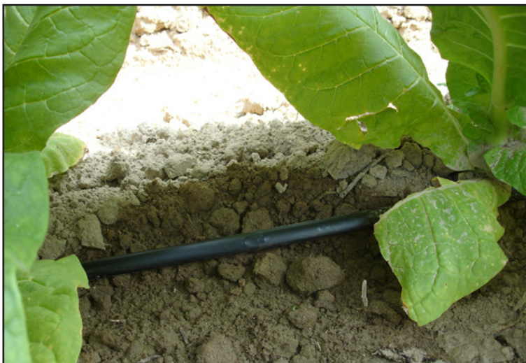
Typical Streamline Dripline, 8 mil, 18" dripper spacing on sandy soil

With sandy soil, we would use 1 line per row (46 inches) with a 0.16 GPH dripper at 18 inch spacing for example. The same 30 acres would have 4 zones of 7.5 acres and the application rate in 6 hours would be 0.24 inches/day.