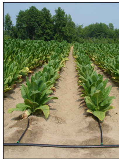
Driplines hooked up to polyethylene (oval tube) submain