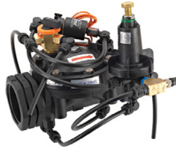
Pressure Reducing Electric Valve

Pressure regulating control valves are recommended for non-pressure compensated dripline to achieve the correct working pressure in the drip system. They can be automated with a battery operated single zone controller so all zones will operate in sequence. The downstream pressure can be adjusted with the bolt on the valve pilot.