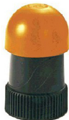
Guardian Air/Vacuum Air Vent