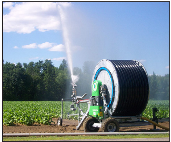
Tobacco irrigated with a traveler - a high percentage of water is lost due to evaporation.