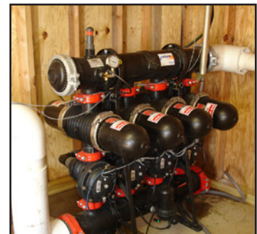
Automatic disc filter