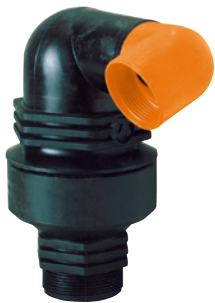
Combination Air/Vacuum and Continuous Acting Air Vent

Air vacuum vents prevent soil suction into the drippers at system shut-down. For every 50 laterals there should be one anti-vacuum vent at the highest elevation and one mounted on the flushing manifold's highest elevation. A double purpose automatic air vent must be installed at the pump and is recommended at the end of the mainline or at the highest elevation.