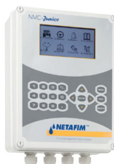
NMC Junior Irrigation Controller