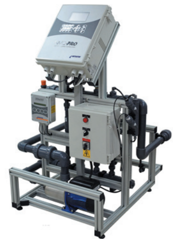
FertiKit 3G Injection System

The system is designed to supply fertilizer to all irrigation blocks using either an automated system or a simple injection pump. Netafim offers a fully configurable fertilizer/acid dosing unit which offers basic functions including controlled mixing of fertilizers/acids with source water into a homogenous nutrient solution, EC/pH correction of nutrient solution and water pre-treatment. Please consult your Netafim USA Dealer to determine which fertilizers may be safely applied through the drip system.