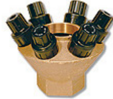
2" x 6 unit Pressure Regulator (33 - 105.6 GPM flow range)