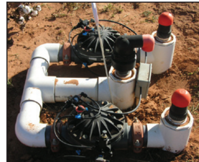
Field installation of pressure control valves and air release/vacuum air vents.