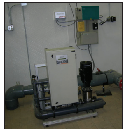
Fertilizer injection and irrigation control system.