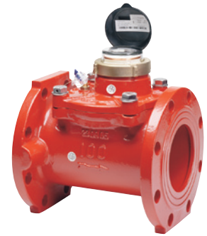
IRT Water Meter

It is essential to measure the water flow in order to monitor the operation of your system and crop's water use. Your drip irrigation system is designed to produce a specific flow rate at a given pressure. Changes in the flow rate may indicate leaks in the system, improperly set pressure regulating valves or even changes in the well and pumping plant. A water meter records accurate water measurements and ensures verification of water pumped - certain states may require these records.