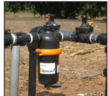
Manual disc filter

An automatic filter system cleans itself when the pressure differential across the filter reaches 7 psi. A pressure differential switch in combination with a flushing controller is a common approach for automation of filter cleaning. Automatic disc filters and sand media filters utilize depth filtration which is the most effective way to remove suspended particles from the water. Manual disc filters can be used for well water.