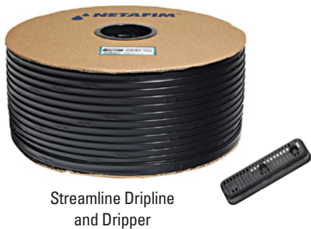
Streamline Dripline and Dripper

Typical dripper spacings are 16 or 18 inches for sandy soils and 24 inches for clay soils. If drip systems for Tobacco could be installed permanently, subsurface, about 12 inches deep, then rotation crops like corn or soybeans can also be irrigated with the same drip system.