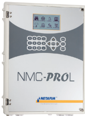
NMC Pro Irrigation Controller

The irrigation system can be monitored and controlled by an irrigation system controller. Netafim controllers operate the entire system improving irrigation efficiencies and fertilizer injection functions. From pump and valve operation, monitoring and control of automatic filters, control of chemical injections and monitoring of water flow, an irrigation system controller maximizes the performance of an irrigation system.