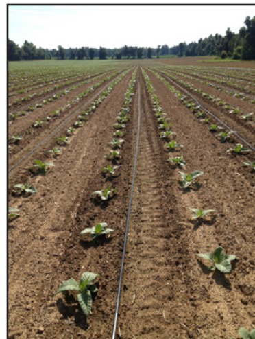
Dripline - between 2 rows of Tobacco