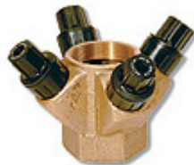
2" x 4 unit Pressure Regulator (22 - 70 GPM flow range)