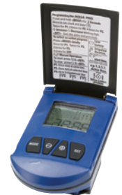
Single Zone Valve Controller