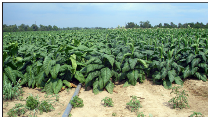
Mainline vinyl tube or LayFlat - vinyl tube can also be used as submain